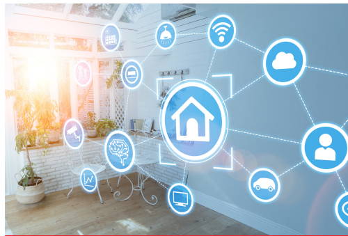
Smart Home Devices